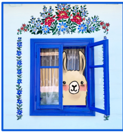
Museum Window in Zalipie, Poland

16. Watch the video (about Kosovo) linked in week 11 of the daily schedule, then answer the following questions: